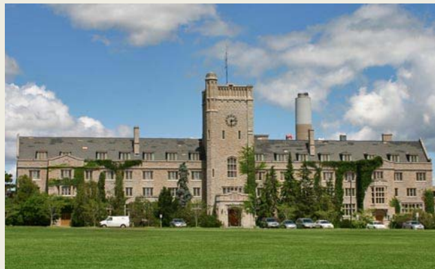
University of Guelph